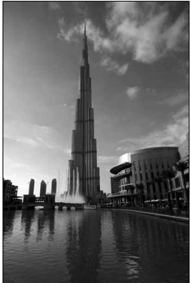
The Burj Dubai, the world's tallest building, in Dubai, United Arab Emirates, on the official opening of the building Monday, Jan. 4, 2010. the Burj Dubai is over 800 metres (2,625 ft) tall and has more than 160 stories, the most of any building in the world and has an observation deck on its 124th floor with 360-degree views of the entire city. The Burj Dubai is home to the world's first Armani Hotel, luxury offices and residences and will ultimately contain a community of up to 12,000 people.