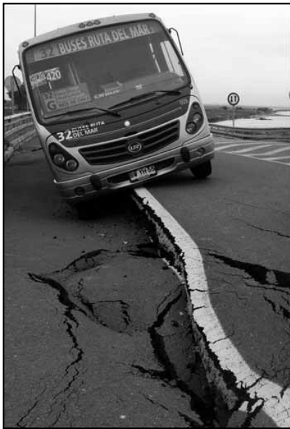
A bus is seen parked by a destroyed road in Talcahuano, Chile, Sunday, Feb. 28, 2010, following a devastating earthquake that struck Chile early Saturday, Feb. 27.

2. Some looters threw rocks at armored police vehicles outside the Lider market, which is majority-owned by Wal-Mart Stores Inc.