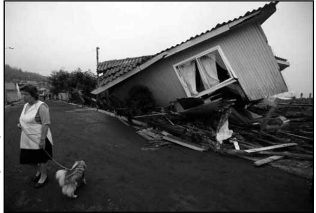
A woman stands in front of a damaged house after an earthquake in Pelluhue, some 322 kms, about 200 miles, southwest of Santiago, Sunday, Feb. 28, 2010. A 8.8-magnitude earthquake hit Chile early Saturday.

1. Why did police fire tear gas and impose a curfew in Concepcion, Chile?