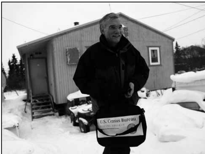
In this Jan. 25, 2010 file photo, U.S. Census Bureau Director Robert Groves leaves the home of World War II veteran and village elder Clifton Jackson, 89, in the remote Inupiat Eskimo village Noorvik, Alaska. More than 120 million U.S. census forms begin arriving Monday, March 15, 2010, in mailboxes around the country, in the government's once-a-decade population count that will be used to divvy up congressional seats and more than $400 billion in federal aid.

4. How much money will the government save in money used for follow-up visits if everyone who receives a census form mails it back?