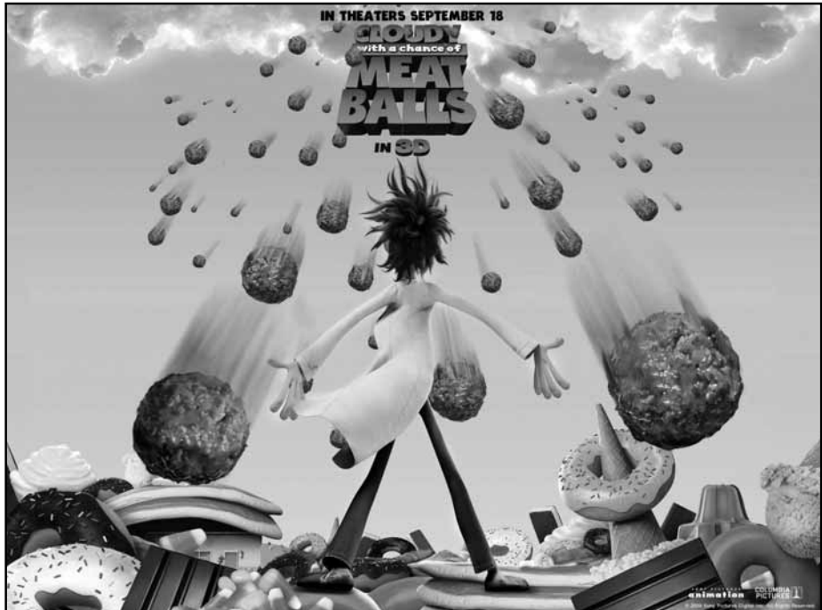
Columbia Pictures' and Sony Pictures Animation's Cloudy with a Chance of Meatballs is advertised as "the most delicious event since macaroni met cheese."