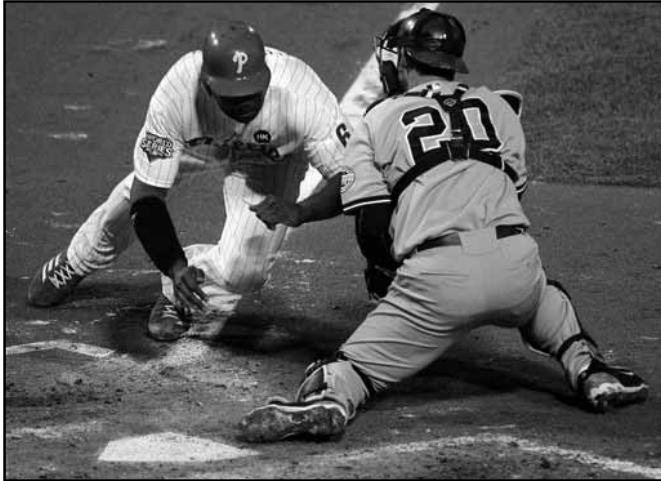
Philadelphia Phillies' Ryan Howard runs into New York Yankees' Jorge Posada (20) as he scores on a single to left field by Pedro Feliz during the fourth inning of Game 4 of the Major League Baseball World Series Sunday, Nov. 1, 2009, in Philadelphia.

1. On which pages of today's edition of the Mount Vernon News will you find the article with the headline, "Yankees beat Phils, take 3-1 lead"?