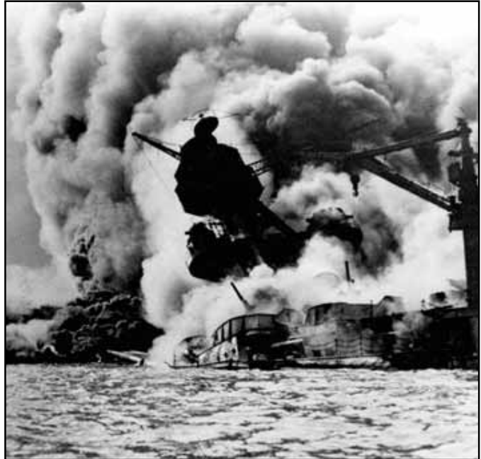
In this Dec. 7, 1941 file photo provided by the U.S. Navy, the USS Arizona is pictured in flames after the Japanese attack on Pearl Harbor in Pearl Harbor, Hawaii. The attack sank four U.S. battleships and destroyed 188 U.S. planes. Another four battleships were damaged, along with three cruisers and three destroyers. More than 2,200 sailors, Marines and soldiers were killed.