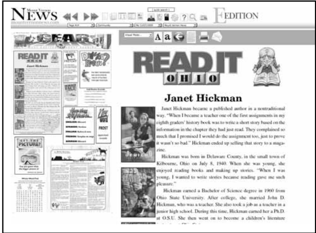
Above is an example of the G.E.A.R. page from the E-Edition.

On which page can you find this article?